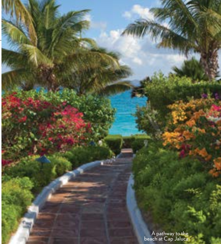
A pathway to the beach at Cap Juluca