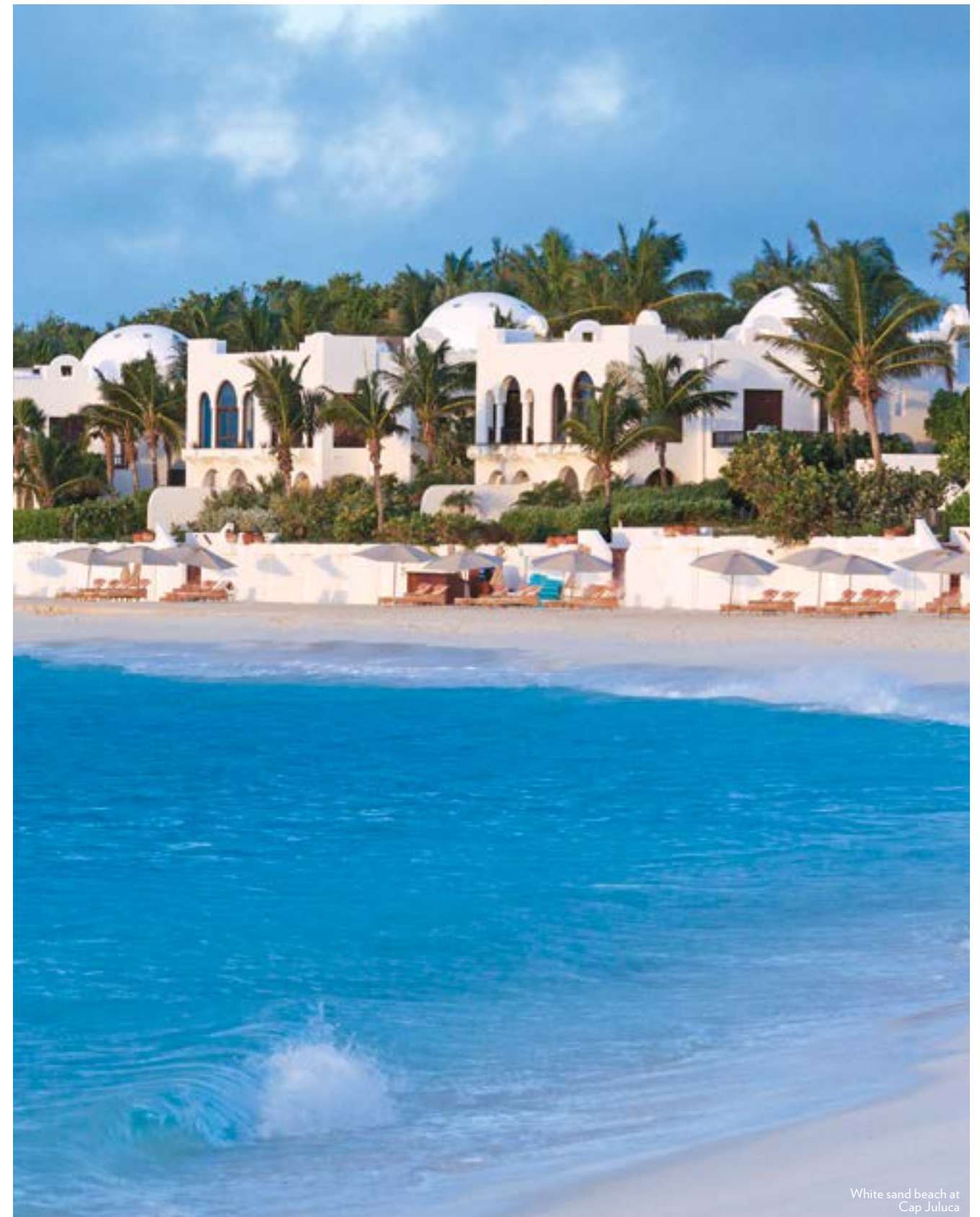
White sand beach at Cap Juluca