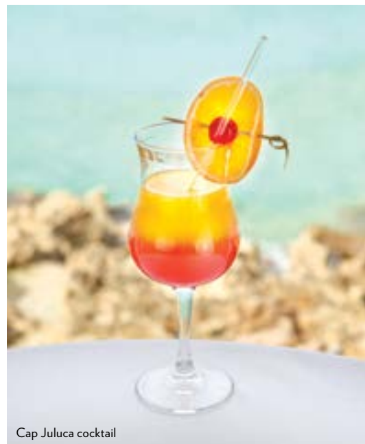
Cap Juluca cocktail