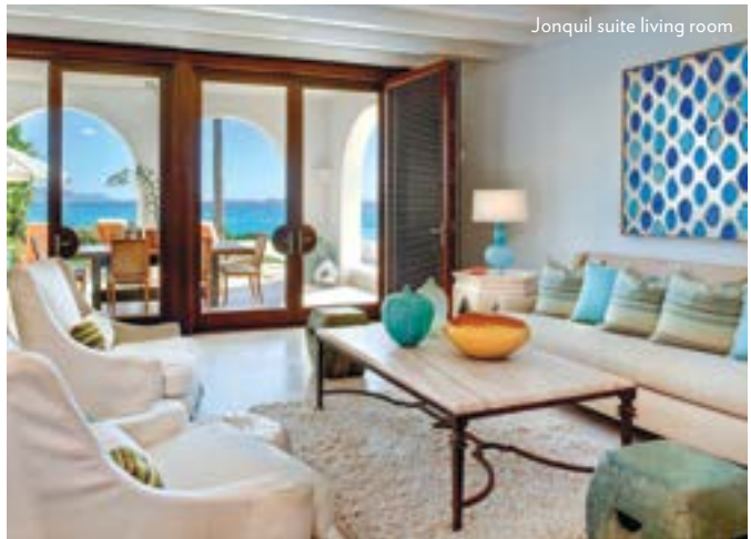
Jonquil suite living room