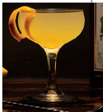
Mama's Squeeze Box is both boozy and sophisticated.

121 S. 17th St., 215-563-5008; square1682.com