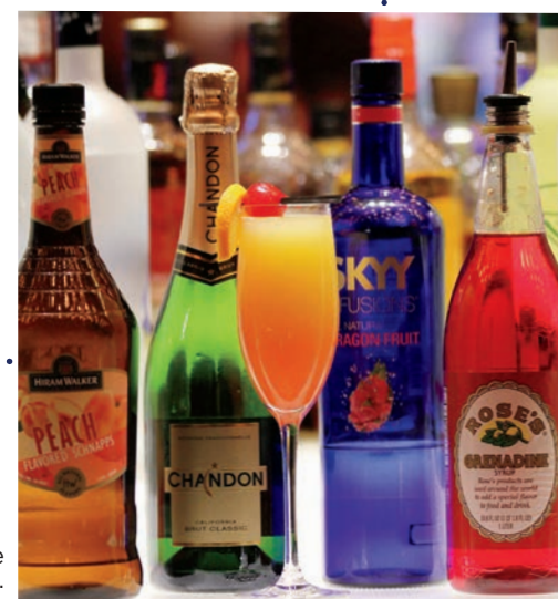
The Champagne Dreams cocktail.