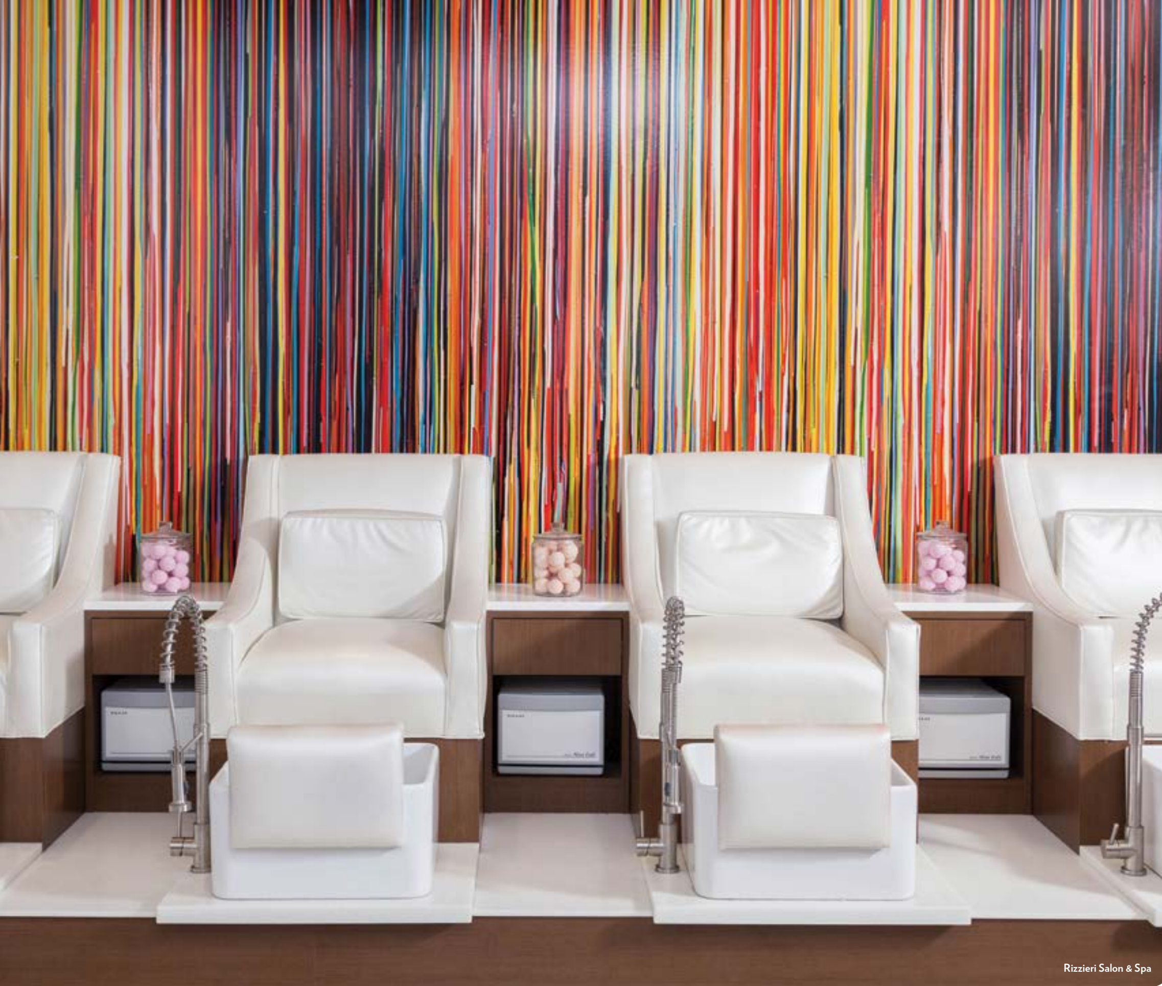
Rizzieri Salon & Spa